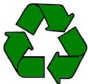
Ten Ways to Help the Earth By: Natasha

Last weekend I went to Conroe. I went fishing when we went to my sister's Young Life Banquet. I caught some brim and a carp. I also saw a water moccasin. I stood very still and it went in the water, it was not very big. Then, I went fishing in a different spot because the water moccasin scared the fish away. Then we went home and had dinner.