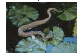
Lake Conroe By: Jeff

Last weekend I went to Conroe. I went fishing when we went to my sister's Young Life Banquet. I caught some brim and a carp. I also saw a water moccasin. I stood very still and it went in the water, it was not very big. Then, I went fishing in a different spot because the water moccasin scared the fish away. Then we went home and had dinner.